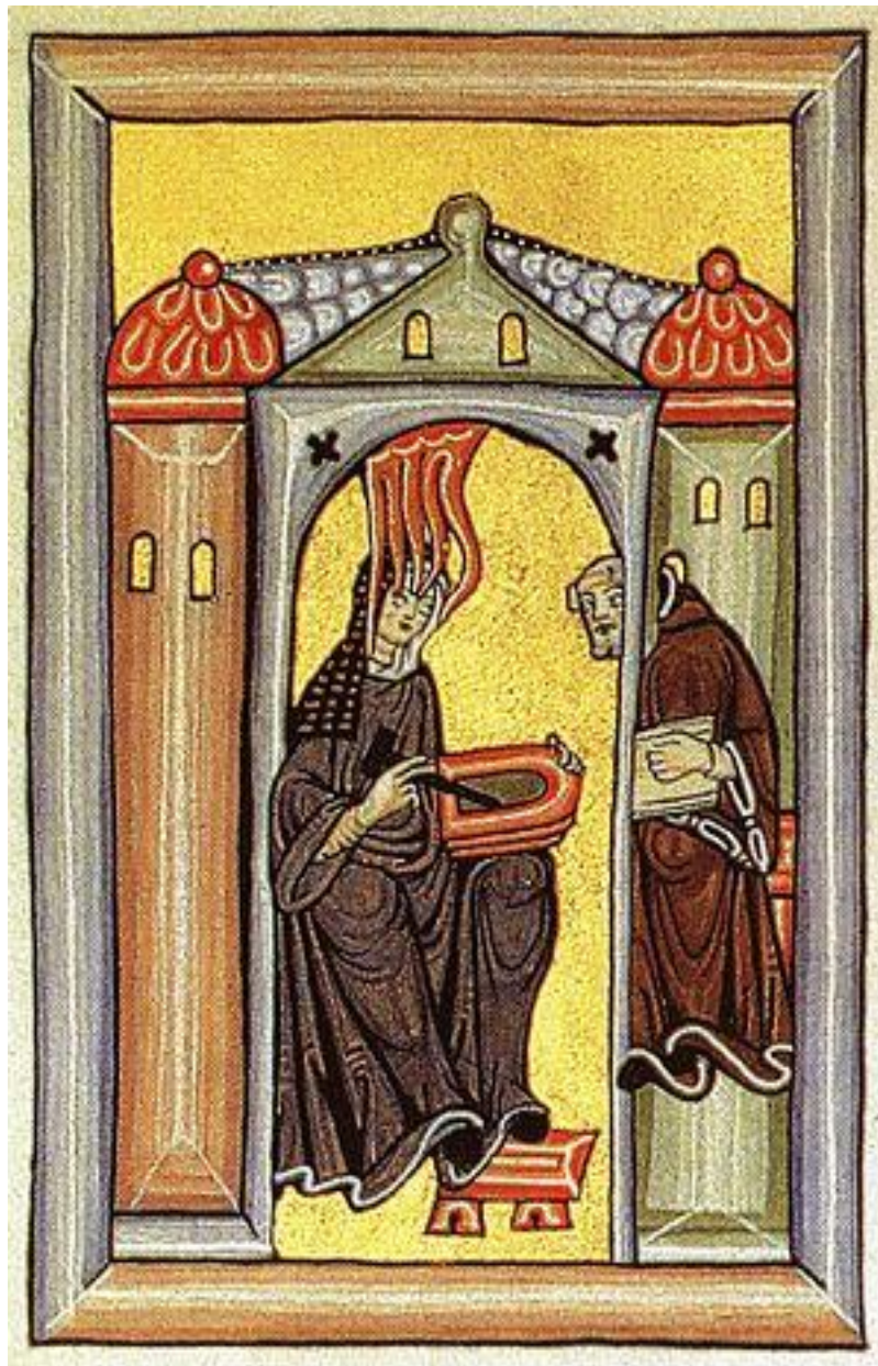
(Rupertsberg Scivias , formerly Wiesbaden, Hessisches Landesbibliothek MS 1, frontispiece)